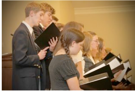
The Greyfriars Choir, singing at the 2012 Convocation service